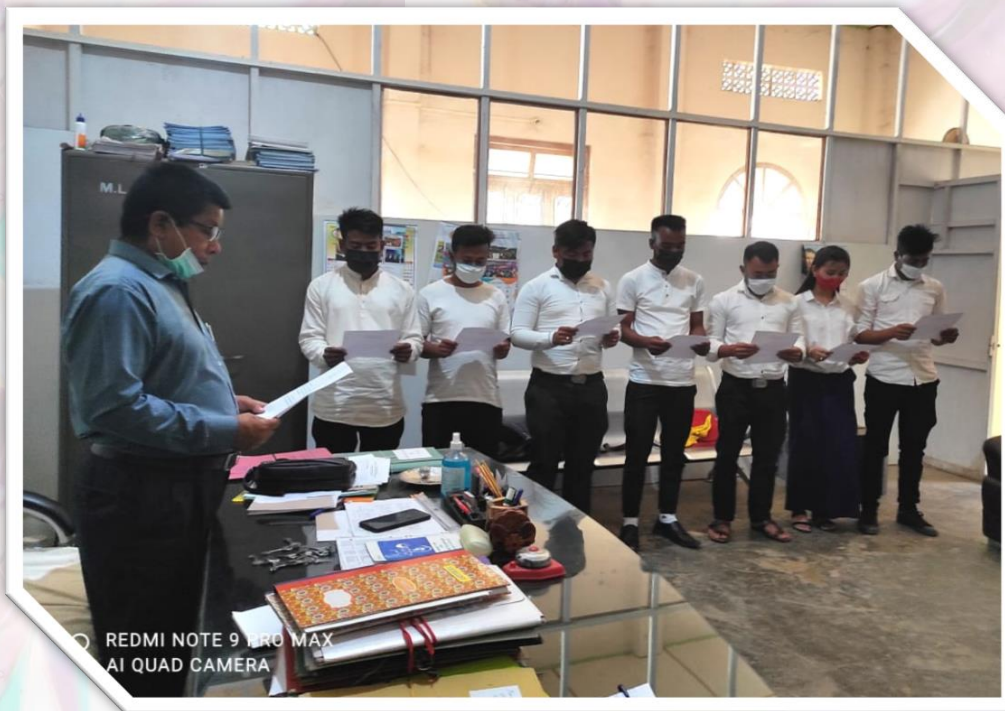
Oath taking ceremony of student's union 2020-21 , Mayai Lambi College